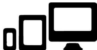
Official & Partner Websites